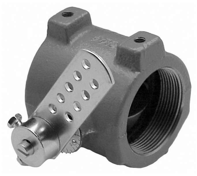
Automatic Butterfly Valve type BVM-A, BVM-AR, BVM-AHD (Shown with Optional Crank Arm / Actuator Not Shown)