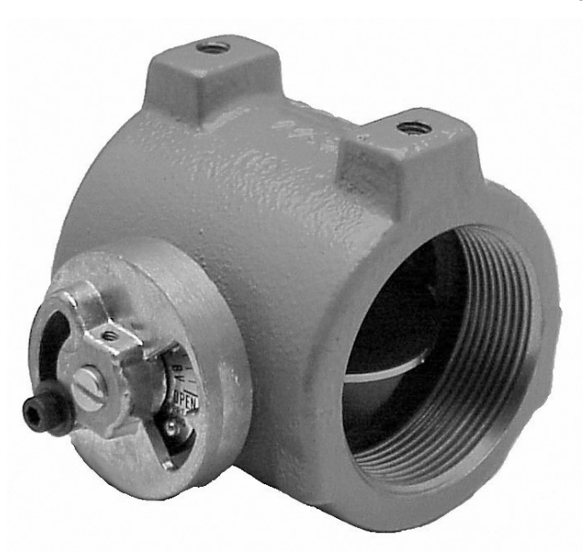
Manual Butterfly Valve type BVM, BVM-R, BVM-HD

Sizes: Rc 1/2" up to and including Rc 3"